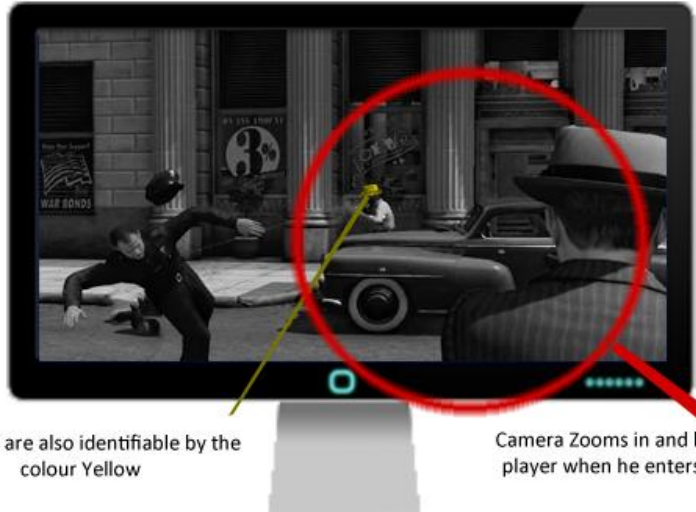
Bad guys are also identifiable by the colour Yellow